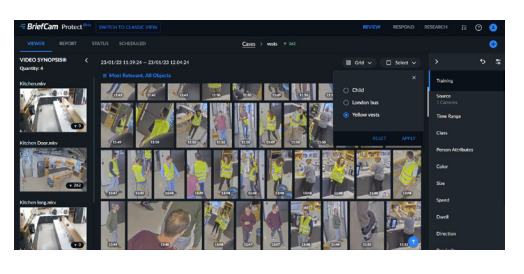
Train custom classes for video search, alerting & data visualization