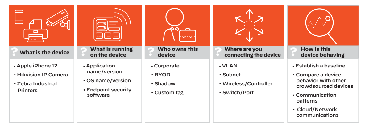
Figure 3 shows the top categories of contextual information that Enterprise IoT Security provides.

Our Enterprise IoT Security analyzes 200 parameters to accurately match each connected device's IP address with its type, vendor, and model to surface 50+ essential device attributes that completely profile the device. Accurate and granular device classification is necessary to differentiate unmanaged network-connected devices from managed IT assets. Doing that enables enforcement of Zero Trust-driven security policies that only allow approved traffic across your network.