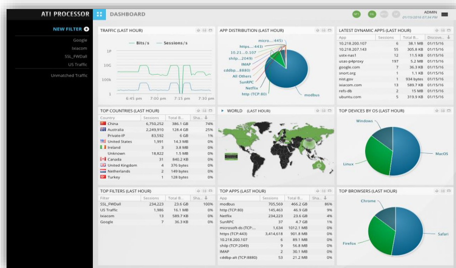
Figure 1: Ixia's AppStack (ATIP) Capabilities provides easy-to-use graphical displays of the traffic captured by Ixia Vision ONE