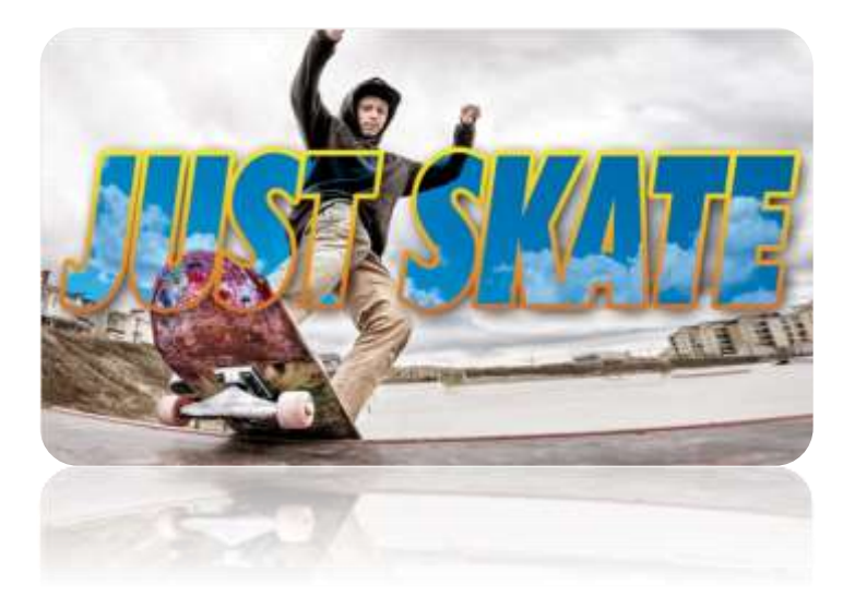
Your viewers will always remember you with the striking artistic visuals you can create with easy-to-use blending tools and enhanced keyframe controls.