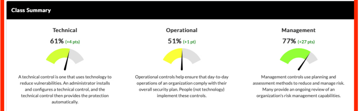
Figure 1: Best Practice Assessment (Class Summary)