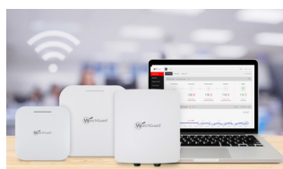
Secure Cloud Wi-Fi