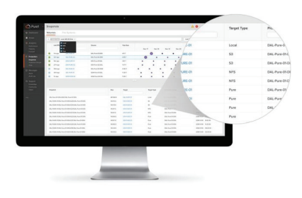
Pure1 cloud-based management