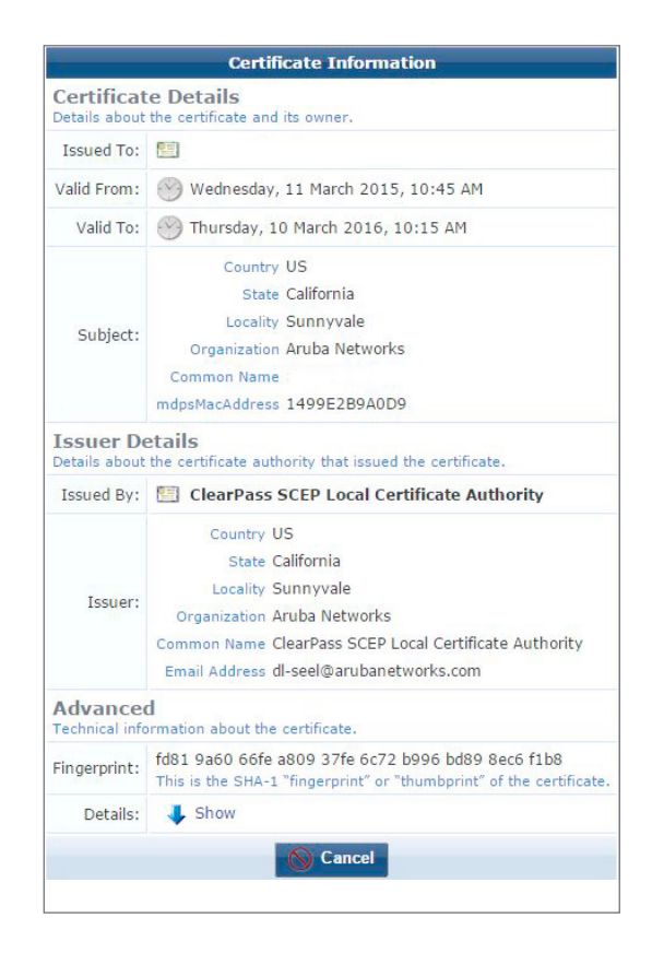
Details of unique credentials for onboarded BYOD endpoints.

The distribution of published device credentials through ClearPass Onboard's built-in certificate authority (CA) safeguards organizations that want to adopt BYOD initiative's without requiring the implementation of an external certificate authority. ClearPass Onboard issued certificates are unique as they also also include specific user and device context.