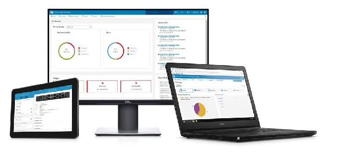
Dell EMC OpenManage Enterprise systems management console

Secure: Security is always the top priority. To protect your infrastructure, OpenManage Enterprise detects drift from a user-defined configuration template, alerts users, and remediates misconfigurations based on pre-setup policies.