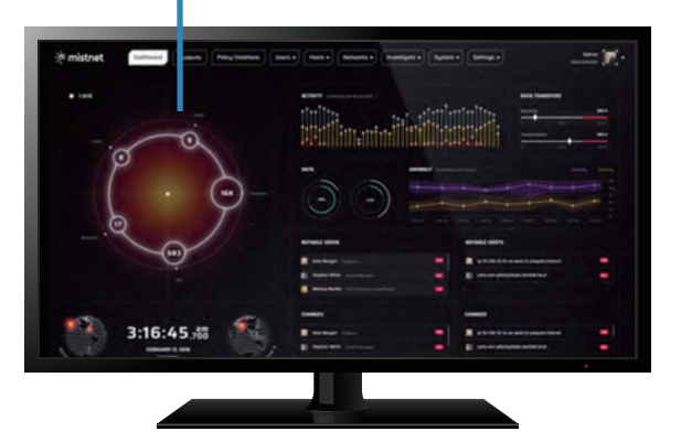
Figure 1: Accurate threat detection with user and host visibility

Real-time dashboard shows detected attack indicators, compliance violations, hosts, users, and incidents.