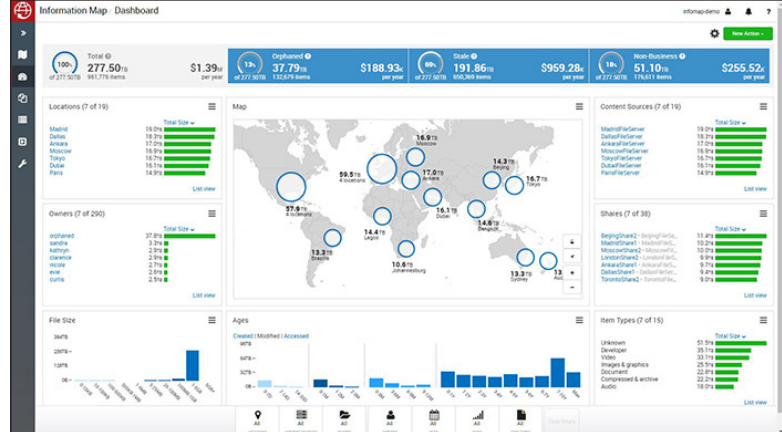
Figure 4. Veritas Information Map renders your information environment in visual context and guides users towards unbiased, information-governance decision making.